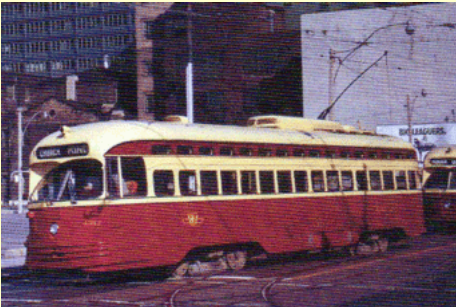
Figure 7: Prototype Photo - TTC 4317 (above).

Muni cars 1050 and 1061 will be supplied with two non-functional trolley poles. All other PCC cars will come with working simulated Form 11 working trolley poles.