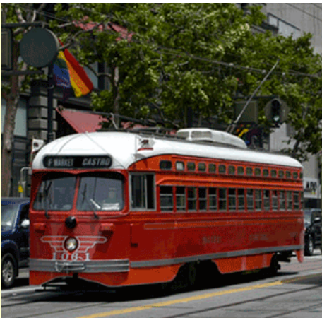
Figure 2: Prototype Photo Muni 1061 on Market Street (above).

Some museum-quality painted brass was also available from Holland Traction Supply: