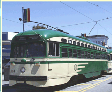
Figure 1: Prototype photo Muni 1050 at 17th & Castro (above).

Two F-line PCC cars, 1050 (San Francisco 1950s) and 1061 (Pacific Electric), will be offered both DCC ready and with ESU sound. This is the third release of the Muni 1050. The Muni 1061 was one of the first F-line PCC cars offered in 2009 and sold out within three weeks.