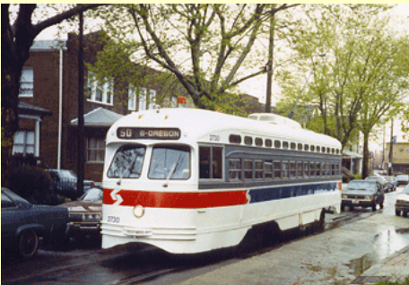
Figure 5: Prototype Photo - SEPTA 2730 (above)