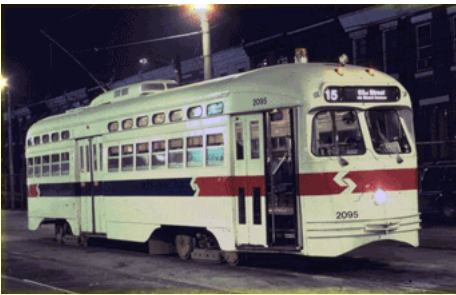
Figure 6: Prototype Photo - SEPTA 2095 (above)

The Trolleyville Times staff is now highly recommending that model railroaders begin treating model train shows as "endangered" species. There is a combination of factors contributing to this. Of course, there is (1) the graying of the majority of model railroaders. Then there is the (2) post 9-11 security concerns at the halls which is costing show promoters more money. The shift in model railroading manufacturing to China (3) has drastically reduced the ranks of the "garage operators" which used to be the staples of most shows and finally (4) the number of model railroad clubs with worthwhile display type layouts is decreasing. Most visitors come to train shows to see the model trains. At this show there were many layouts but not as many as in the past. The bottom line is when you hear of a model train show in your neighborhood, plan to go over and look. Your entrance fee helps delay the inevitable. If you are reading this and do not care to go to a model train show, the inevitable has already reached you.