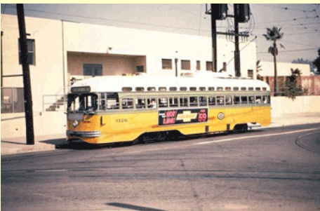
Figure 3: Prototype Photo - LAMTA 3126 (above).